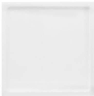
SHARED BATH Wall, Porcelain, Kate Lo, Interceramic Down 6x6