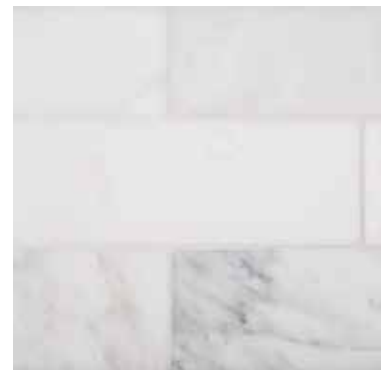
MASTER BATHROOM Shower Wall, Marble, Tile x Design, Streamstone West End White Honed 4x12