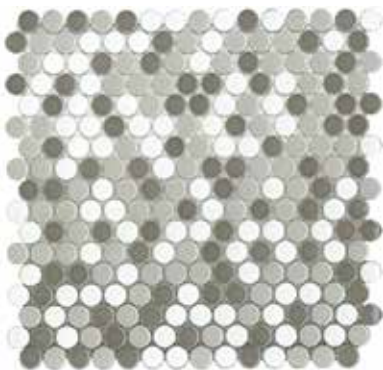
SHARED BATH Floor, Porcelain, Kate Lo, Olympia Penny Round Mosaic